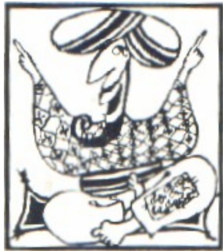
MULLAH NASR EDDIN