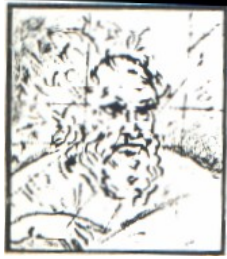
LEONARDO DA VINCI