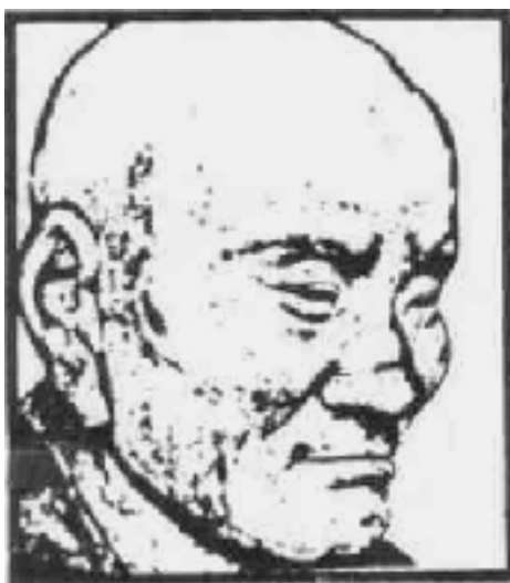
LEADER OF THE SEVEN