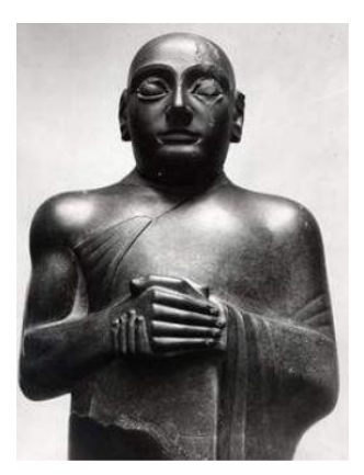
Gudea of Lagash

The Language of Gesture is the latest in a series of seminars supported by the DuVersity that began in 2000 with Systematics and Globalization. The last three seminars were The Real Present Moment , Music and The Dramatic Universe and Beyond . The series is dedicated to developing and applying the method of systematics, emphasising progression in depth and unity in diversity and diversity in unity .