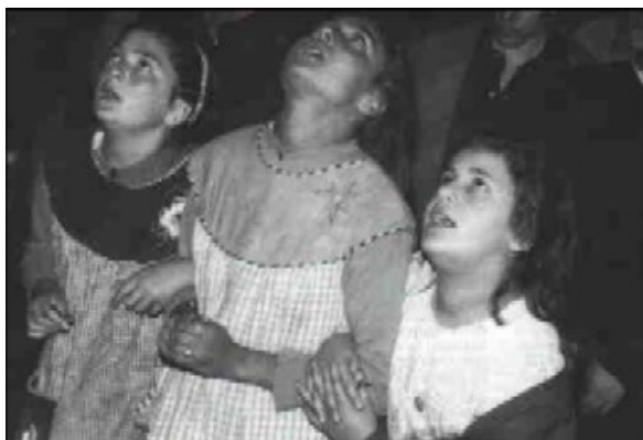
The children of Garabandal with Mary

When I was in Medjugorje during Easter 1989 the daily apparitions of Mary were taking place in the organ loft at the back of the church. When Mary appeared, and