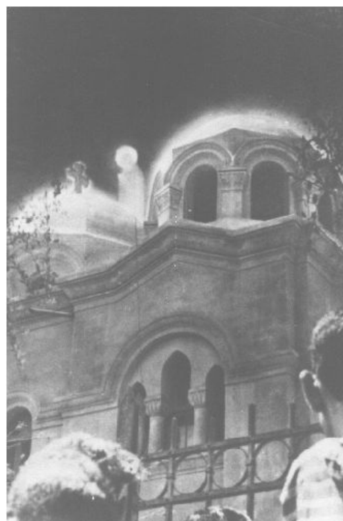
Zeitoun, Cairo, 1968

It is also worth noting that every mosque has a prayer niche dedicated to Mary - which is more than can be said for every Christian church, or even every Catholic church !