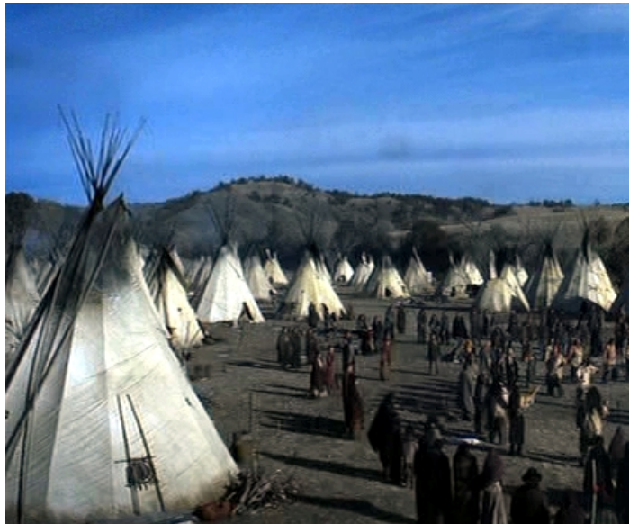
Wounded Knee before the massacre

"By the time it was over, 25 troopers and more than 146 Lakota Sioux lay dead, including men, women, and children. Some of the soldiers are believed to have been the victims of "friendly fire" as the shooting took place at point blank range in chaotic conditions. Around 150 Lakota are believed to have fled the chaos, many of whom may have died from hypothermia."