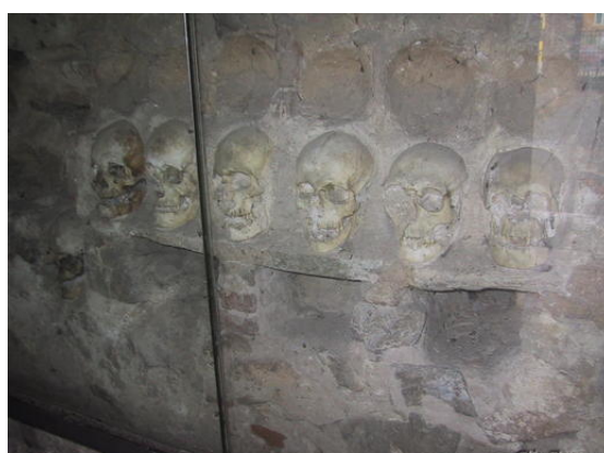
Skulls in the wall of the Niš skull tower. Built at the beginning of the 19th century after an uprising, the tower served to scare off those who still thought of rebelling against the Ottoman Empire.

mounted on a tower to serve as a warning to any other would-be revolutionaries. In all, 952 skulls were included, with the skull of Sinđelić placed at the top."