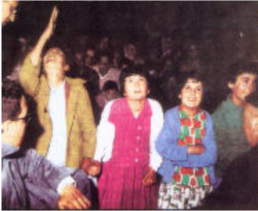
The children at Garabandal with Mary