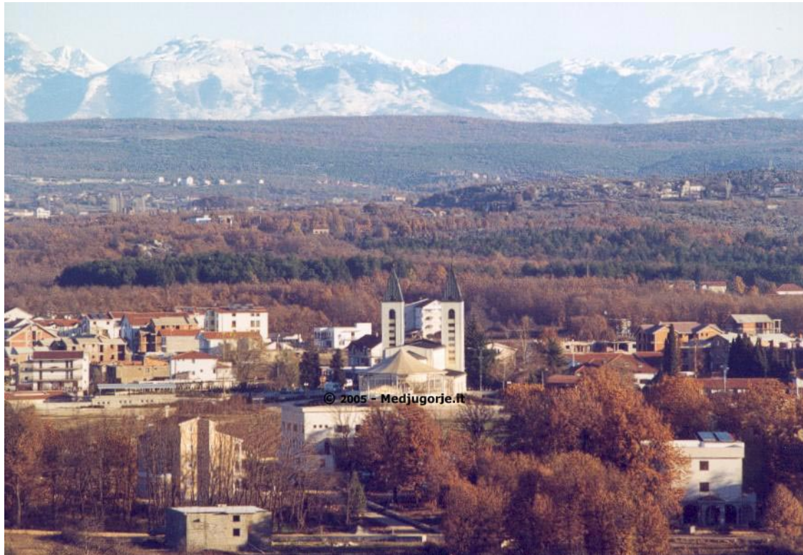
View of Medjugorje and the church of St James, Bosnia-Herzegovina