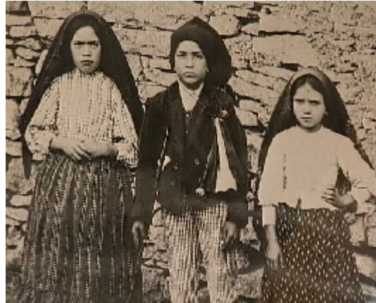
The Young Seers of Fatima

Fatima: This village in northern Portugal is one of the most well known sites of any Marian apparition in the last one hundred years. The Virgin Mary appeared here to three children for a total of six times, all on the 13th of the month, between May and October 1917, culminating on October 13th with the miraculous 'dance of the sun' as it has come to be known, which was witnessed by approximately 70,000 people. There are at least two things about Fatima which highlight the wish for unification that Mary is expressing in her appearances. Firstly, Fatima was the name of the most favoured daughter of Mohammed, the founder of Islam. The Prophet once said that he regarded his daughter as the highest woman in heaven after the Virgin Mary. Fatima was the youngest daughter of Mohammed and the only one to bear any children. Within two