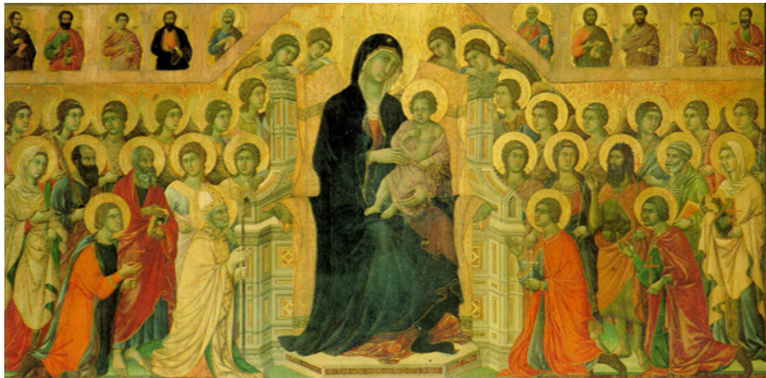
'Virgin and Child in Majesty' by Duccio di Buoninsegna, Siena Cathedral

- Sienna, Italy , latitude 43° 17', was the home of St Catherine of Sienna, In 1370 she received a series of visions of Hell, Purgatory, and Heaven, after which she heard a command to leave her withdrawn life and enter the public life of the world. She began to write letters to men and women in authority, especially begging for peace between the republics and principalities of Italy and for the return of the papacy from Avignon to Rome. She carried on a long correspondence with Pope Gregory XI, also asking him to reform the clergy and the administration of the Papal States. Catherine was considered to be one of the most brilliant theological minds of her day, although she never had any formal education. She didn't learn how to write until the end of her life, but that never stopped her. She dictated her literary masterpieces, sometimes reciting three documents to three secretaries at the same time. Catherine's ways of communicating were always uninhibited in their directness. For example, during the Great Western Schism, in defence of Pope Urban VI, she rebuked three Italian cardinals who were supporting the anti-pope, writing to them, "what made you do this? You are flowers who shed no perfume, but stench that makes the whole world reek." . She asked to be buried at the Basilica Santa Maria sopra Minerva (Basilica of St. Mary over Minerva) in Rome, so named because it was built directly on the foundations of a temple to Minerva, the goddess of wisdom.